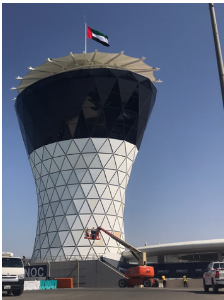
Formula 1 Racing track, Abu Dhabi Johnson Arabia AWP on site for maintenance work .