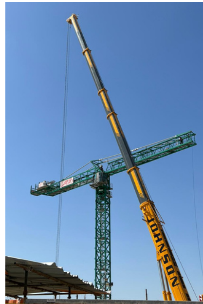
Ras Al khor, Dubai This project was to set up Jaso cranes for a project.