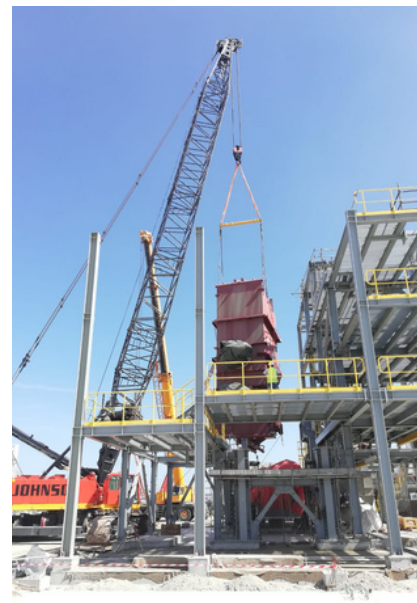
Sugar Refinery , Oman Our 280 tonne working in Sohar Sugar refinery