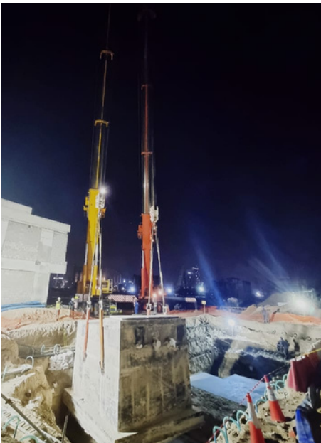
Meydan Site, Dubai Lifting & Re-locating of precast chamber 132tonnes using a 700t and a 500t mobile crane for tandem lift.

While we are proud of every thing we do, these projects showcase our versatility and skill.