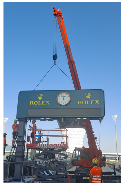
F1 Grand Prix, Abu Dhabi Our Scissor lift and crane were used to help get the iconic Rolex clocks up for the event.