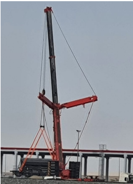
Etihad Rail, Abu Dhabi This project required our cranes on site to life the individual locomotive units to be placed on tracks

While we are proud of every thing we do, these projects showcase our versatility and skill.