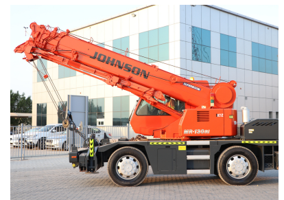
KATO KRM (MR130Ri) 13 TONNE