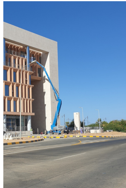
Office Complex, Oman This project entailed external maintenance of an almost complete building using our AWP's