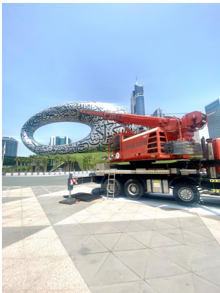
Museum of the Future, Dubai Johnson Arabia mobile crane used for external Maintenance work near museum of the future.